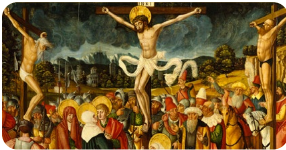
1. Paschal Mystery and the Eucharist

During this Year of Parish Revival, we are encouraging parish priests to implement a series of Sunday homilies to be devoted exclusively to the Eucharist. Eucharistic worship and the implications of this worship are vital for our whole lives. These homilies might cover: