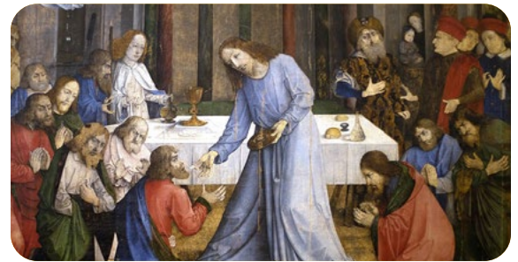
2. Real Presence and Eucharistic Worship