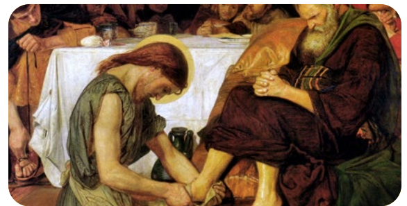
4. Eucharist and the Call to Evangelize and Serve 1