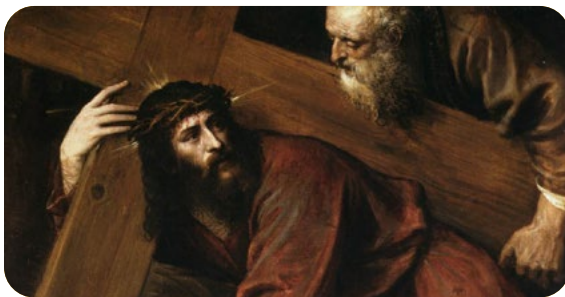
3. Eucharist and the Call to Holiness