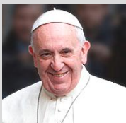
Pope Francis February 14, 2014

"Love is a relationship ... It is a reality that grows."