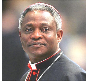
His Eminence, Peter Kodwo Cardinal Turkson Former President of the Pontifical Council for Justice and Peace; Prefect of the Dicastery for the Promotion of Integral Human Development; Archbishop emeritus of Cape Coast (Ghana)