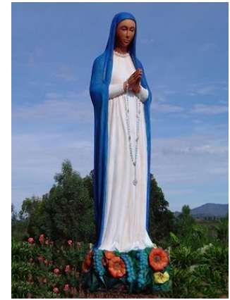
Our Lady of Kibeho "Mother of the Word" Kibeho Rwanda, Africa

Archdiocese of Louisville's Congress XII Delegates ...and others!