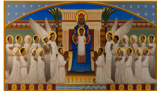
National Black Catholic Congress, Inc. © 2017

Archdiocese of Louisville Office of Multicultural Ministry African American Catholic Ministries