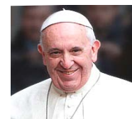
Pope Francis Corner

In a recent audience at the Vatican with priests and catechists from the Diocese of Rome, Pope Francis identified one of the dangers that the family faces in society: living in a hurry. This way of life, in which one does not have time to be with their family, has a profound effect on the parents, the children and even the Church.