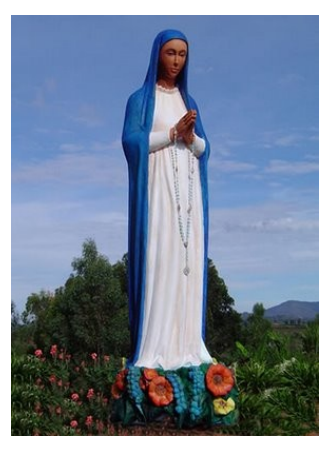
Our Lady of Kibeho "Mother of the Word" Kibeho Rwanda, Africa

This is an implementation of the National Black Catholic Pastoral Plan & the Archdiocese of Louisville's Strategic Plan. Made possible through Catholic Services Appeal